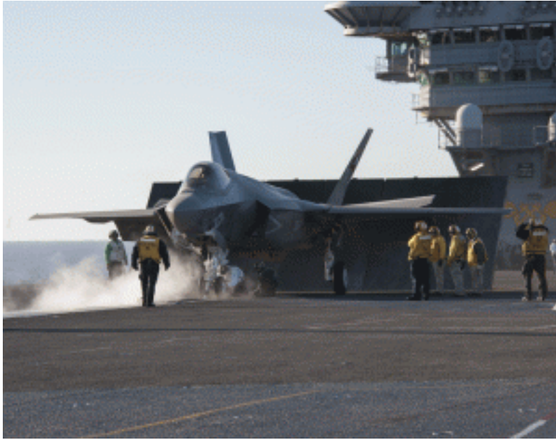
F-35C on the USS Nimitz. November 2014.

And in so doing, they will establish a framework more appropriate to developing, and executing 21st century concepts of operations.