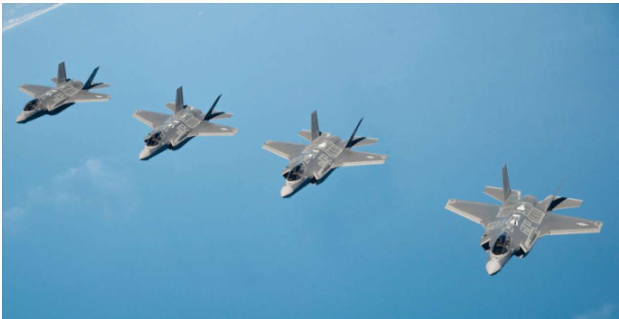
F-35As being refueled near Eglin AFB.

And the discussion with “Beef” highlighted an important clarification in another sense. Instead of confusing folks with C5ISR and with situational awareness, we should focus on C2 plus information war.