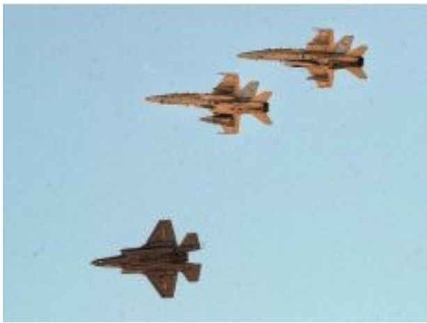
F-35B arrives with two F-18s. The past escorts the present.

Stealth is a survivability factor and is critically important because it multiplies the effectiveness of the fighter—one doesn't add stealth but incorporates it into the very existence of the fighter. Being a multiplying factor means it is sensitive and can really drive the entire performance of the airframe and system combat performance.