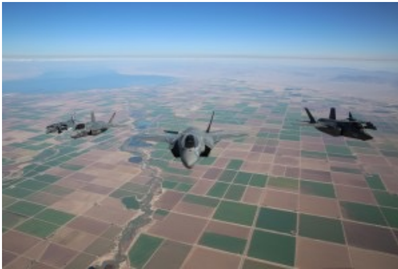
Three F-35B Lightning II Joint Strike Fighters with Marine Fighter Attack Squadron 121, 3rd Marine Aircraft Wing, and two AV-8B Harriers with Marine Attack Squadron 211, 3rd MAW, fly in a “V” formation during fixed-wing aerial refueling training over eastern California, Aug. 27, 2013. The F-35B joint strike fighters practiced refueling with Marine Aerial Refueler Transport Squadron 352.

Just like the F-111 El-Dorado Canyon strike an “emcon” strike, stealth enabled, can come as a complete surprise.